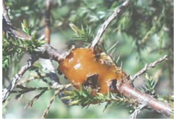
Fig. 1B. Quince rust canker on cedar.

infect apples and pears (basidiospores) must come from cedar trees and the spores that infect cedar trees (aeciospores) must come from apple trees. Therefore, when the supply of basidiospores produced on cedar trees is exhausted each year, no further infections can occur on apples and pears during that season.