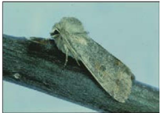
Fig. 1. Green Fruitworm adult.

The GFW complex are members of the Noctuidae family and fly at night. Flight begins during apple bud development and peaks at tight cluster, with flight completed by the pink stage. GFW adults have a wingspan of about 1.5 inches. The forewings are grayish pink; each is marked near the middle with 2 purplish-gray spots, outlined by a thin pale border with the hind wings lighter in color than the forewings (Fig. 1). Females begin