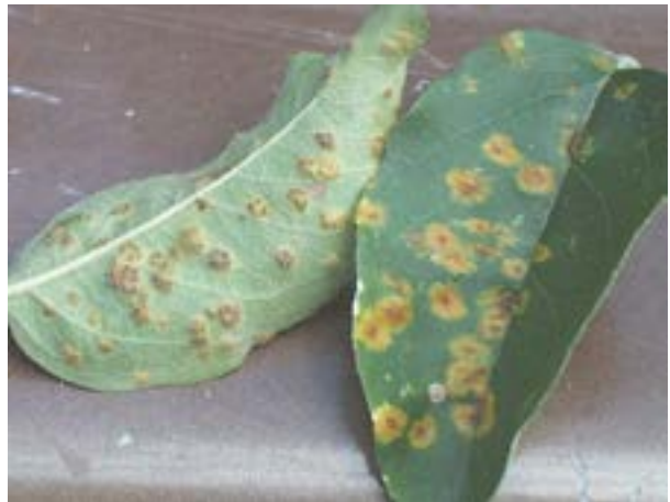
Fig. 2. Cedar apple rust lesions on leaves.

Rust lesions on leaves are almost always bright yellow or orange, at least initially (Fig. 2). However, quince rust infections on fruit may lack the typical yellow or orange coloration. Quince rust produces fruit distortions that can take many different forms (Fig. 3).