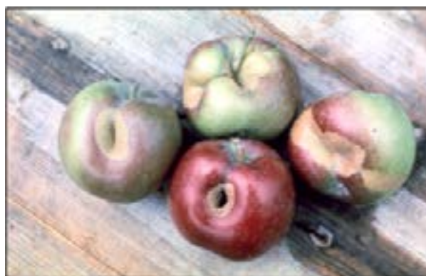
Fig. 4. Green Fruitworm fruit feeding injury.

Control: In years of heavy infestation pressure from GFW, as much as 10% fruit injury can occur. Employing adult pheromone traps will provide growers with information on GFW presence and the onset of adult flight. Scouting for larvae to determine levels of pest pressure should begin shortly after tight cluster. Although NY has not developed thresholds for this pest, a provisional threshold of 1 larva or feeding scar per tree has been used to begin applications in Massachusetts. A more conservative threshold should be applied in high-value apple varieties on dwarfing rootstocks in high-density planting systems. If GFW populations historically cause economic injury to fruit, management should begin from tight cluster to pink to target the pre-bloom Lepidoptera complex. The GFW complex and OBLR are less susceptible or resistant to most organophosphates, with the exception of chlorpyrifos (Lorsban, IRAC Class 1B). If Lorsban is used as a pre-bloom foliar application, it will also control San