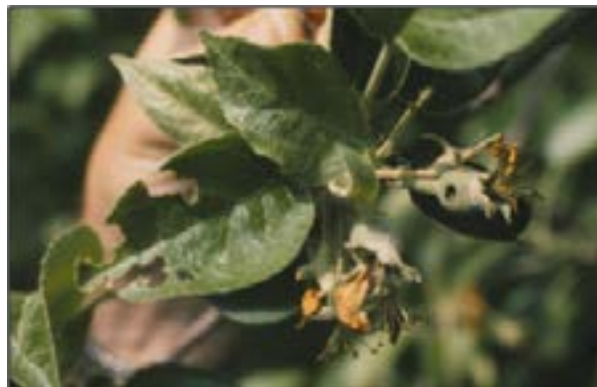
Fig. 3. Green Fruitworm foliar feeding injury.

In the northern regions of the Champlain Valley and throughout the mid-Hudson Valley, GFW can be a severe pest on early developing apples. The GFW larvae pass through 6 instars, the early stages possessing a grayish green body, brown head and thoracic shield. Mature larvae, about 1.5" in length, have a light green body and head. A number of narrow white stripes run along the top of the body with a wider, more pronounced white line running along each side. The areas between the stripes are speckled white. Early stages of larvae feed on foliage and flower buds, and are found inside rolled leaves or clusters (Fig. 3). Mature larvae damage flower clusters during bloom, feeding on developing fruit and foliage 2 weeks after petal fall, with peak populations during bloom. The fruit remaining on the tree will have both shallow and deeply indented corky scars at harvest, which are indistinguishable from obliquebanded leafroller injury (Fig. 4). Larvae then drop to the ground, burrow into the soil to pupate, and overwinter 2–4 inches into the soil to emerge the following spring as adults.