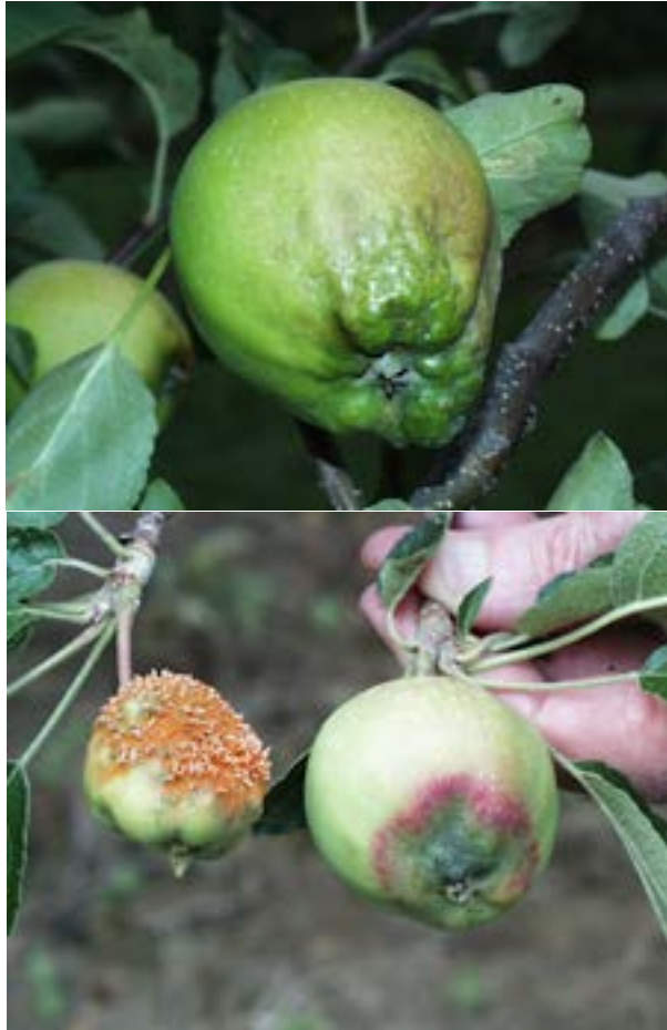
Fig. 3. Quince rust on fruit.

fall bud stages. Fruit become resistant to infection within about a week after petal fall. Risks of fruit infections may be slightly lower during bloom than during the periods before and after bloom because the open petals decrease the probability that spores released during bloom will land on the base of the flower where fruit infections are initiated.