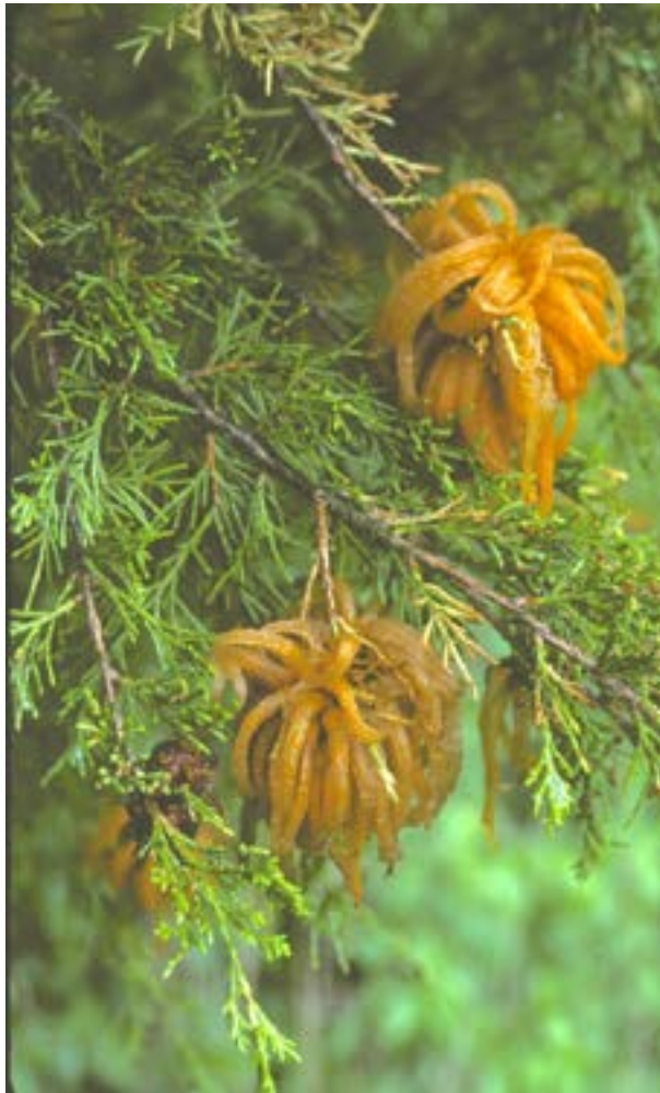
Fig. 1A. Cedar apple rust gall on cedar.

All of the rust diseases require alternate hosts in the cedar ( Juniperus ) family. The rust fungi infect apple or pear only during spring and early summer. Spores from these pome fruit hosts are blown back to cedars in late summer or fall. All of these rust pathogens overwinter on their cedar hosts and then produce spores in gelatinous masses during spring rains (Fig. 1). None of the rust fungi have a secondary infection cycle on pome fruits. The spores that