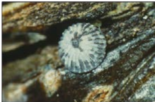
Fig. 2. Green Fruitworm egg.

ovipositing on twigs and developing leaves when apples are at the half-inch green stage. GFW eggs are about 3/8" in diameter and 3/16" in height. GFW eggs are white with a grayish tinge and ridges radiating from the center (Fig. 2). The egg takes on a mottled appearance shortly before hatch. A female will deposit only 1 or 2 at any given site, laying several hundred eggs from late March to mid-May in the Hudson Valley.