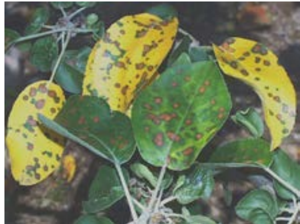
Fig. 6. Rust-induced leaf spot.

entry point for other leaf-spotting fungi such as Botryosphaeria obtusa and Phomopsis species that will ultimately cause frog-eye leaf spot. In trees not protected with fungicides, this leaf spotting can cause almost as much damage as cedar apple rust would cause on a rust-susceptible cultivar (Fig. 6).