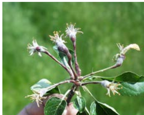
Fig. 4. Quince rust on stems.

Quince rust probably causes the most economic damage in commercial orchards because infections occur on fruit and fruit stems. Although quince rust appears only sporadically, when weather conditions and tree phenology align to create ideal infection conditions, more than 40% of fruit in commercial orchards can become infected with quince rust during a single infection period in trees not protected with fungicides. Virtually all apple cultivars are susceptible to quince rust, but disease incidence may vary among cultivars both because of inherent genetic differences in susceptibility and because the bloom stage (and therefore susceptibility) during infection events will vary depending on the cultivar phenology at the time of the infection event. Severe infections during late bloom can result in so many stem infections that all fruit will be aborted (Fig. 4). Quince rust infections on pears are much less common than on apples.