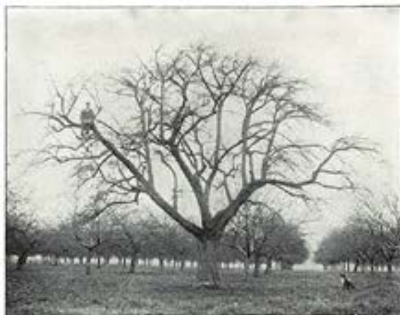
FIG. 26. THE OLD TREE STANDS AS A REMINDER OF THE DAYS OF THE STAGE- COACH AND THE PAGING-IR.