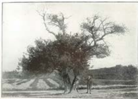
FIG. 1. IRISH APPLE TREE STILL STANDING NEAR THE GENEVA EXPERIMENT STATION IN 2001.

The N.Y. Fruit Pest Control Field Days will take place during Labor Day week on Sept. 7-8 this year, with the Geneva portion tak- ing place on Thursday Sept. 7, and the Hudson Valley installment on the second day, Friday , Sept. 8 (yes, that's a day later in the week than we usually hold it, but we've decided to push it back to accommodate some of our presenters' teaching schedules). Activities will commence in Geneva on the 7th, with registra- tion, coffee, etc., in the lobby of Barton Lab at 8:30 am. The tour will proceed to the orchards to view plots and preliminary data from field trials involving new fungicides, bactericides, miticides, and insecticides on tree fruits and grapes. It is anticipated that the tour of field plots will be completed before noon. On the 8th, participants will register at the Hudson Valley Laboratory starting at 8:30, after which they will view and discuss results from field tri- als on apples and other fruit crops. No pre-reg- istration is required for either event. ❖❖